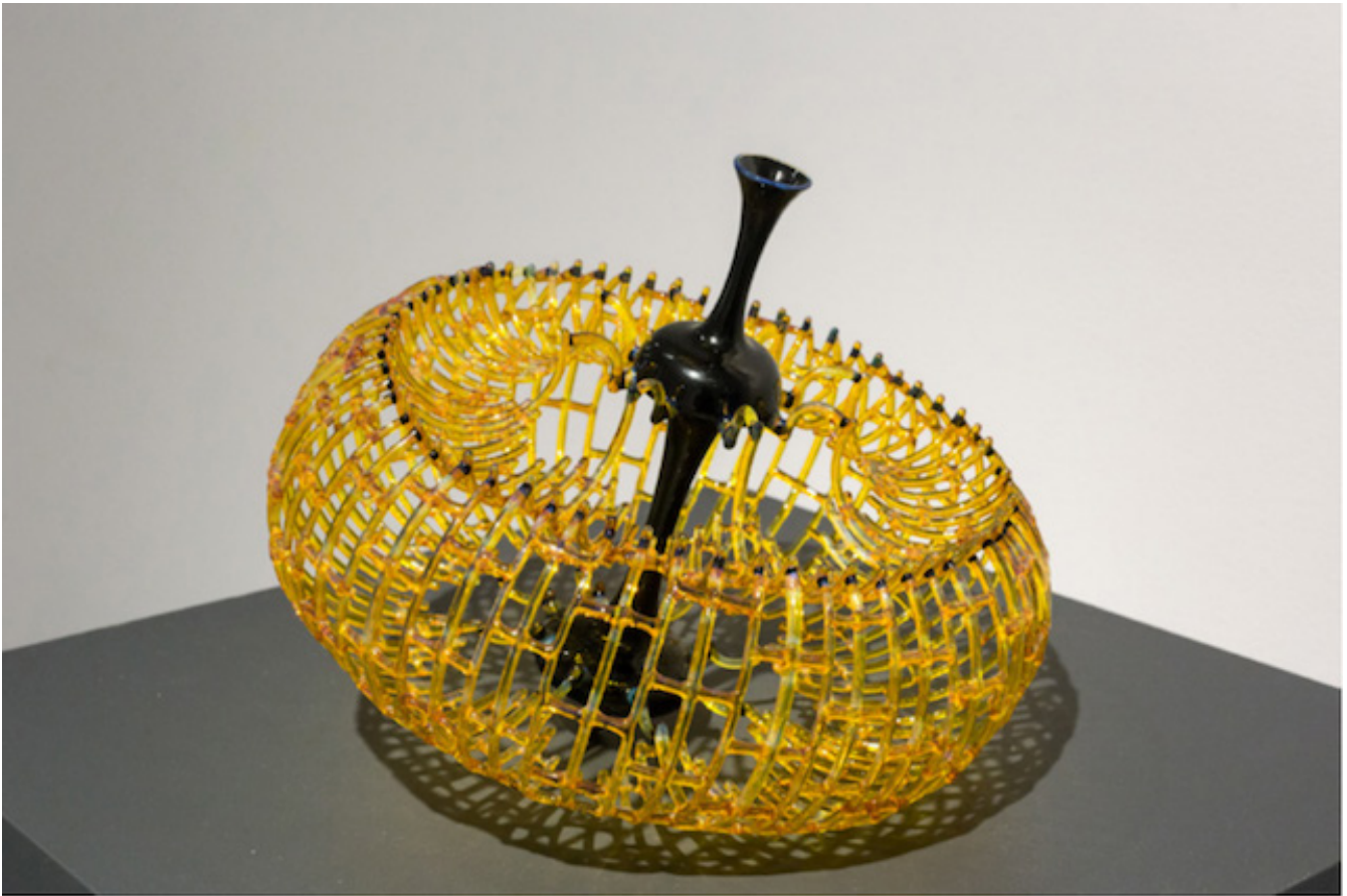
Micah Evans - Amber Buttress Bottle, 2012, Borosilicate glass, 8.5 x 11.5 x 11.5 in.