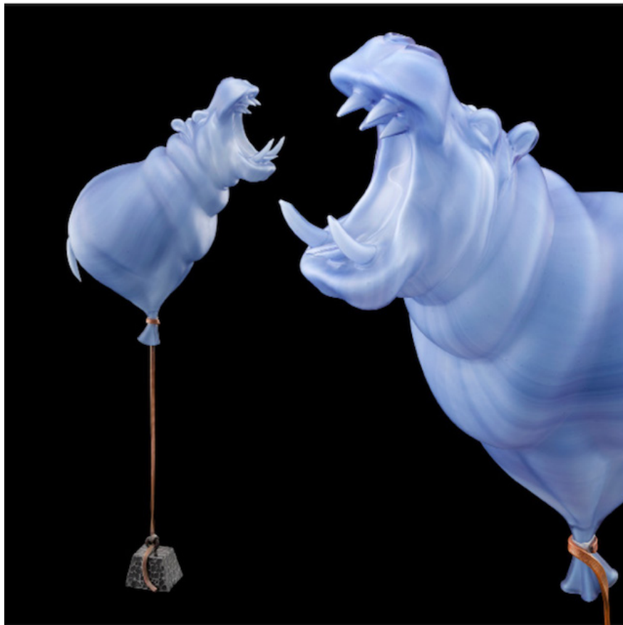
Chris Ahalt - Blue Hippo Balloon, 2016, Borosilicate glass, copper, and iron, 22.25 x 5.5 x 3.5 in.

Gravity-defying glass animal balloons sit suspended in the air held up by a copper string and a pair of whales push each other on a miniature swing set. This is just a taste of the wondrous imagery on display at the inaugural Simon Says exhibition at the Chesterfield Gallery. The show features an ethereal parade of contemporary glass sculpture from an eclectic lineup of international artists, including Kiva Ford and Joshua Bernbaum. The show reaffirms the boundless potential of glassware as a medium, with artworks that range from the abstract to the anatomical.