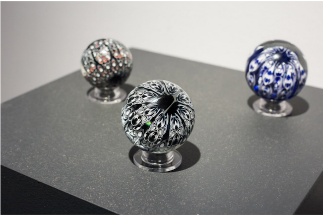
Yoshinori Kondo marbles