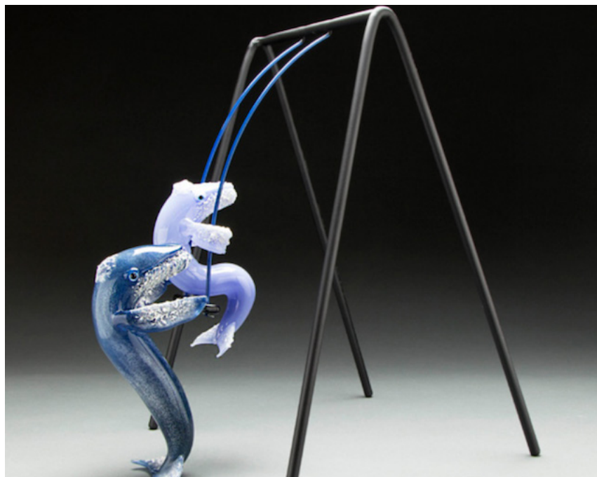
Chadd Lacy – Gimme a Push, 2016, Borosilicate glass, wire, and stainless steel, 15.25 x 11.25 x 10 in.

The majority of works in the show are made from Borosilicate glass, a material known for having low coefficients of thermal expansion, meaning it's more resistant to temperature change because it does not expand like normal soda-lime glass. It's made from a combination of sand, sodium-carbonate, boric oxide, and limestone—the result is a less dense material with a higher melting point. Check out some more of our favorite pieces from the show below: