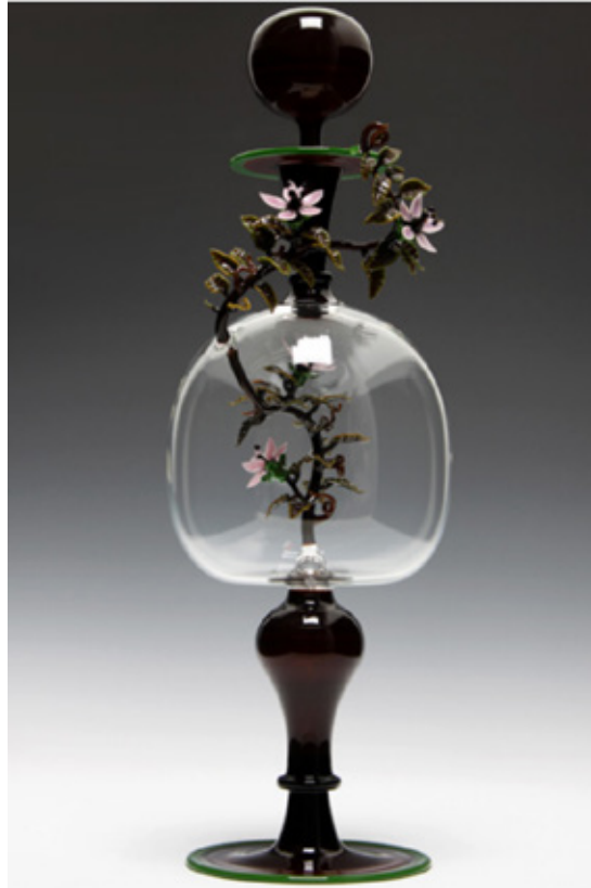
Kiva Ford and Jupiter Nielsen – Persistence of Nature, 2015, Borosilicate glass, 15 x 6 x 6 in.

The majority of works in the show are made from Borosilicate glass, a material known for having low coefficients of thermal expansion, meaning it's more resistant to temperature change because it does not expand like normal soda-lime glass. It's made from a combination of sand, sodium-carbonate, boric oxide, and limestone—the result is a less dense material with a higher melting point. Check out some more of our favorite pieces from the show below: